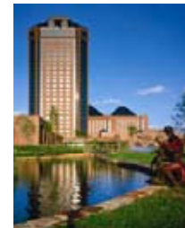
The Host Hotel Hilton Anatole Hotel 2201 Stemmons Freeway Dallas, TX 75207